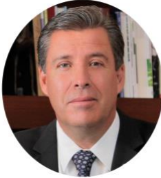
Miguel Márquez Márquez Governor of the State of Guanajuato

“It is an honor and source of great joy for the state of Guanajuato to participate in the 2018 Flower Carpet event. Our thanks goes to the city of Brussels and the Brussels Flower Carpet association for opening the heart of your city to our own multicolored art, flower carpet artists from Uriangato city.