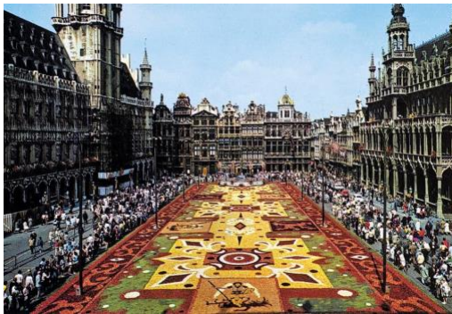
The first Flower Carpet in 1971

He very quickly realised that floral carpets would be an excellent vehicle for the promotion of his beloved begonias which he had always worked with, technically, economically and aesthetically. After years of attempts and calculations, this architect, who was inventive and imaginative, and knew how to make the most of the numerous resources of begonias, became an expert in the creation of superb floral carpets with sophisticated colours and complicated designs.